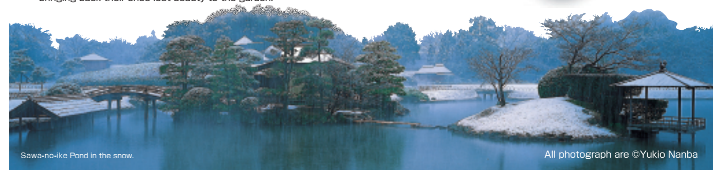
Sawa-no-ike Pond in the snow.