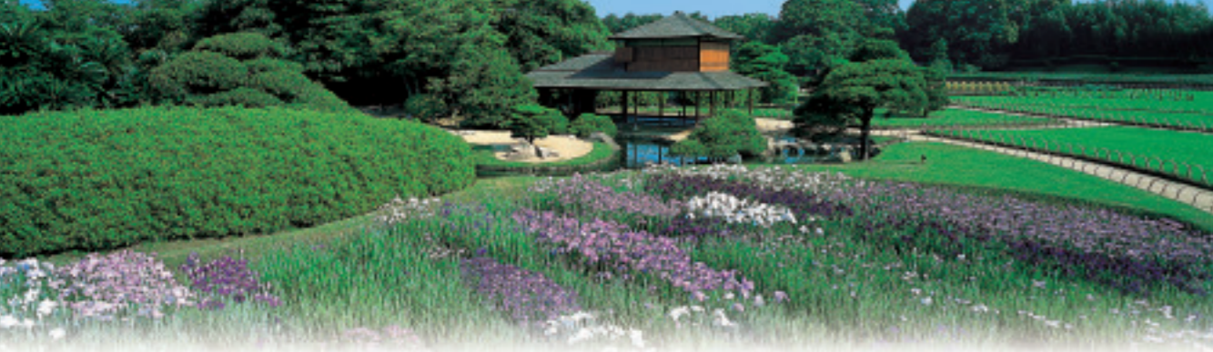
Ryūten Rest House and the Japanese Iris Garden.