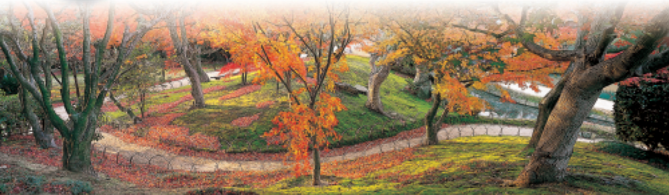
Maple trees on the Yuishinzan Hill.