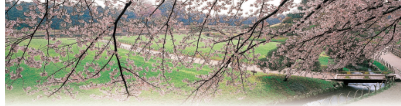
A view overlooking the garden from the South Gate.

Okayama Korakuen has been considered one of the most famous gardens in Japan since the Edo Period. The tea houses located throughout the garden were built for each succeeding daimyō (Japanese feudal lord), as were En'yō-tei House, the Nō Theater Stage, and other buildings. The garden was designed in the kaiyū ("scenic promenade") style, which presents the visitor with a new view at every turn of the many paths connecting the vast lawns, ponds, hills, tea houses and streams.