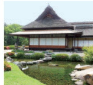
The garden was originally called Kōen ("back garden") because it was built behind Okayama Castle. However, since the garden was built in the spirit of "sen-yū-kō-raku" (literally, "grieve earlier than others, enjoy later than others"), the name was later changed to Korakuen in 1871.